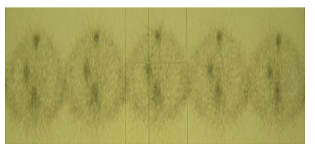
Figure 2. Galium-67 scintigraphy imaging shows an increased uptake of <sup>67</sup>Ga in right hilar region

Unicentric Castleman's disease, usually seen as a mediastinal mass, is a rare lymphoproliferative disorder with an unknown etiology (1,2). This disease is named by Benjamin Castleman, a medical doctor who reported clinicopathologic features of a case with a solitary hyperplastic mediastinal lymph node first time in 1956 (3). There are two types in clinical presentation, which are localized-unicentric and multicentric disease. Hyaline-vascular and plasma cell types occurs histopathologicaly (2).